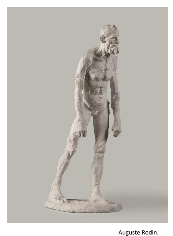
Eustache de Saint-Pierre, ca. 1885-86 Musée Rodin, Paris. Rodin Donation, 1916

Following the Cubist experiments Surrealist period, in his quest for "figures and heads seen in perspective" Giacometti increasingly pared down his sculptures to the point where he produced the type of work for which he became best known. At this point his characteristic elongated figures replaced his earlier, technically perfect works and the manipulation of the material and modelling became the key feature of his sculptures. This was also the case for Rodin, who sometimes allowed the clay to remain visible beneath the bronze, revealing an energetic, dynamic modelling that paradoxically achieves the expression of human fragility. This is evident in works such as Eustache de Saint Pierre of ca. 1885-86 and the different draperies produced for the figure of Balzac.