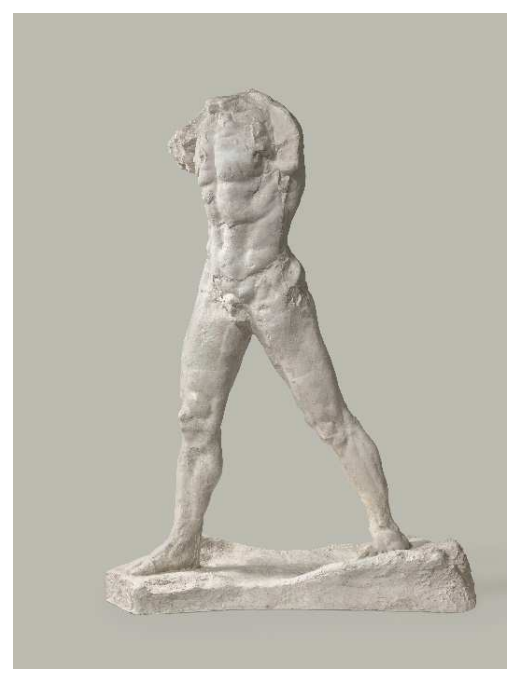
Auguste Rodin. L'Homme qui marche, grand modèle [The walking Man, large model], 1907 Musée Rodin, Paris

Giacometti's numerous drawings of works by Rodin reveal the importance of this discipline in his creative process. In a number of his various books on Rodin he copied L'Homme qui marche [The walking Man] - a work created in 1907 from a smaller version of Saint John the Baptist - next to photographs of different sculptures by Rodin, as if reflecting on the subject in order to later incorporate this subject into his own work. The versions of The walking Man produced by both artists are undoubtedly some of the most celebrated and best known creations of world sculpture and it is clear that Giacometti took Rodin as his starting point for this subject. The same is the case with the sculpture L'homme qui chavire [The falling Man] and the different versions of that theme that he produced from the late 1940s onwards.