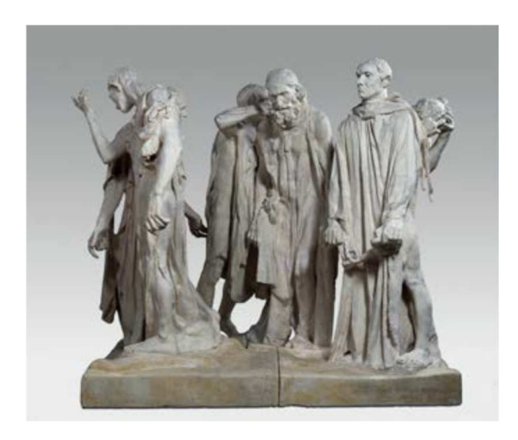
Auguste Rodin Monument des Bourgeois de Calais [Monument to the Burghers of Calais], 1889 (modern copy) Musée Rodin, Paris

Auguste Rodin was one of the first sculptors to move towards reality in his work, in a reflection of his opinion that "beauty only resides where there is truth". In order to locate sculpture in the world of reality, which is complex and variable rather than static and frozen, Rodin formulated his so-called "technique of profiles". Rather than working on his sculptures from a single position and with a preeminent viewpoint, he made sketches from all possible angles, moving around the model. When he transferred that movement to the work it was not always understood. In 1885 the City Council of Calais commissioned a monument from the artist to commemorate the heroic act of a group of citizens who offered themselves as hostages to Edward III of England following a lengthy siege of the city in 1347 during the Hundred Years War. Rodin designed the monument as six independent figures, which he then assembled with the aim of retaining each element's separate identity while also maintaining the vision of the whole. By breaking away from tradition - as rather than presenting a single figure he sculpted a group of six men moving as individuals toward their tragic fate - the sculpture was not well received and was not unveiled until 1895, six years after it was completed.