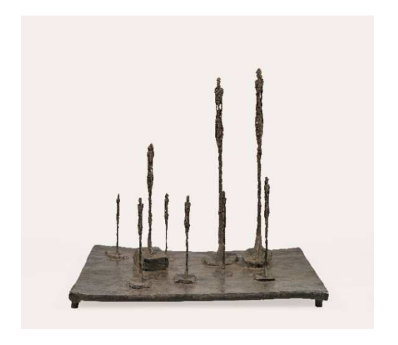
Alberto Giacometti La Clairière [The Clearing], 1950 Fondation Giacometti, Paris