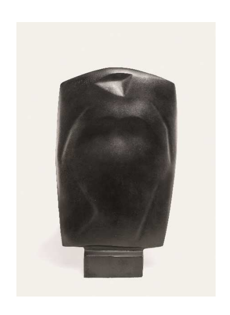
Alberto Giacometti Femme (plate V) [Woman (flat V)], ca. 1929 Fondation Giacometti, Paris