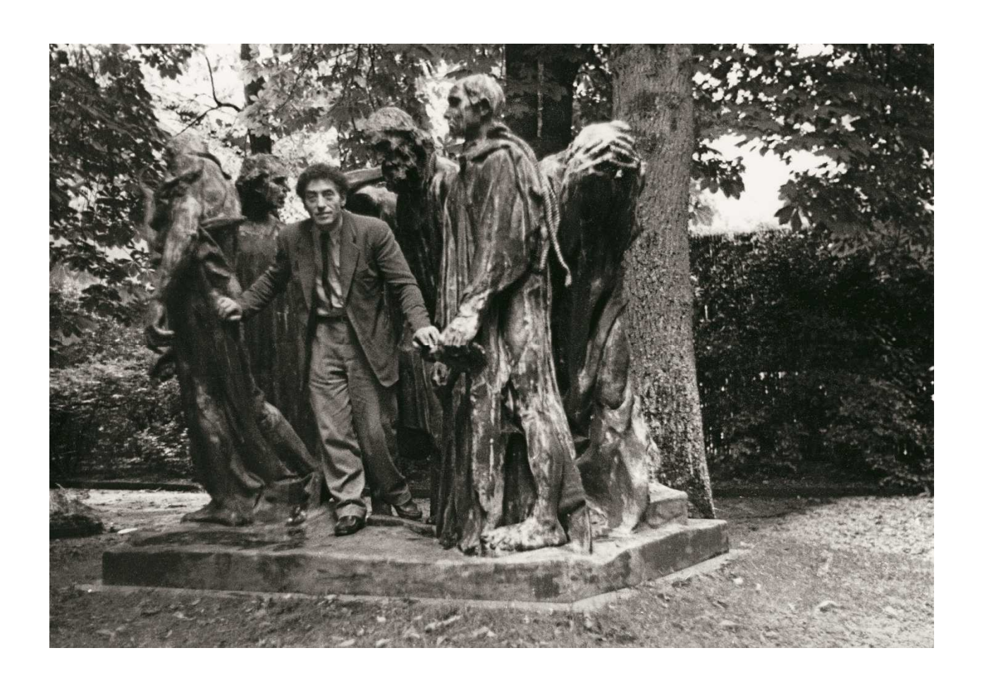
Fundación MAPFRE Recoletos Exhibition Hall 6 February to 10 May 2020